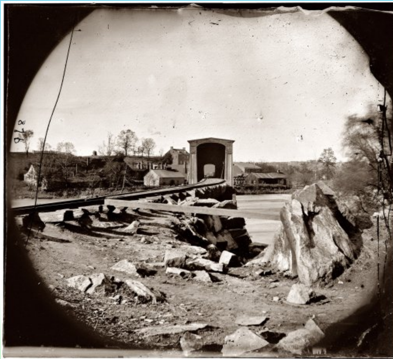
A destroyed railroad in the South